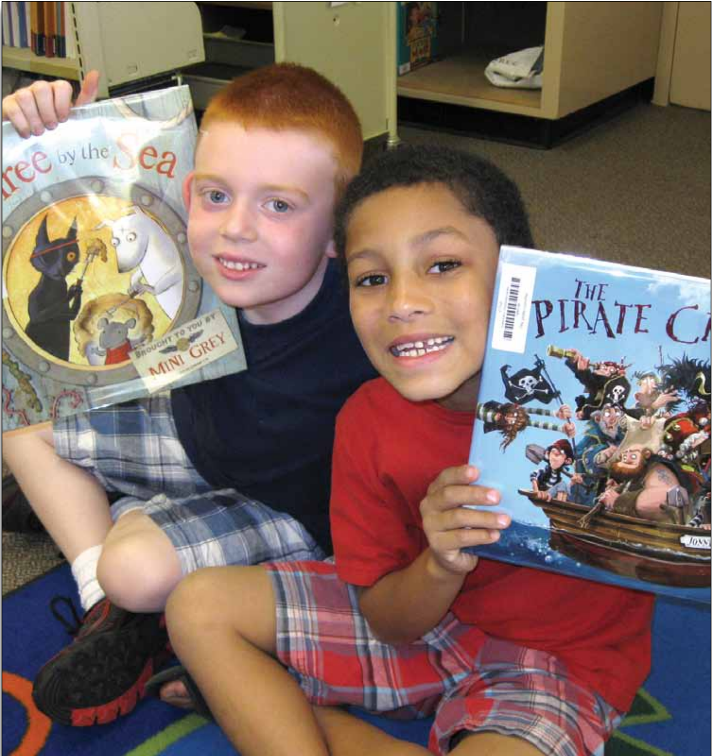
Grant Early Childhood Center students enjoy new library books purchased with funds provided by the Foundation in partnership with the Giacometto Foundation.