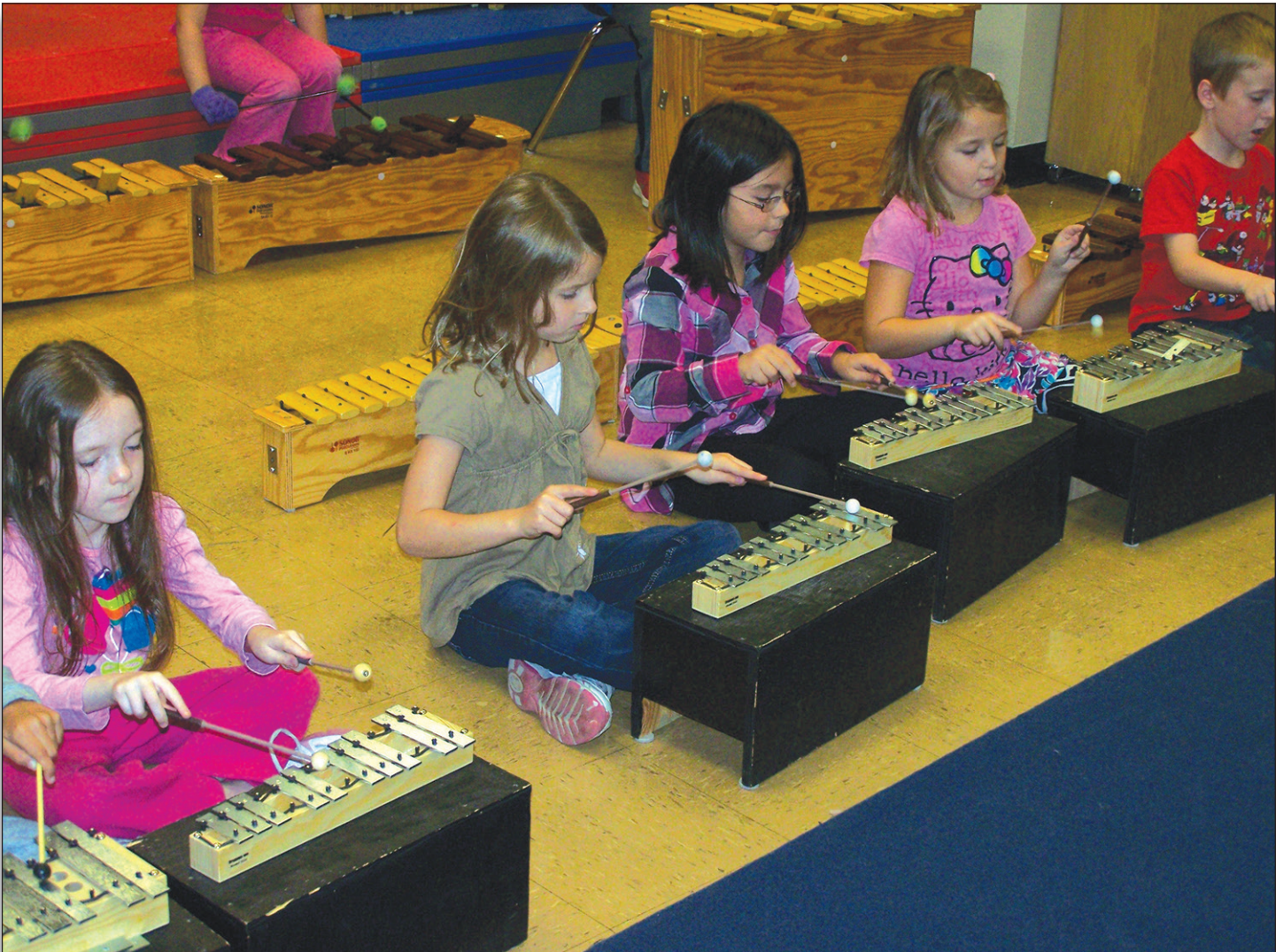
Students at Arthur Elementary School participate in Orff music direction via glockenspiels. Funding for the purchase of the Orff equipment was provided by The Giacoletto Foundation through the Foundation's School Project Grants program.

Jefferson High School – Spark-ing Student Interest in 21 st Century Learning