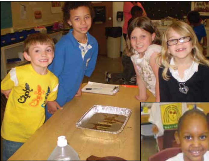
These students are all smiles as they and learn about molecules and surface tension in preparation for making their own bubbles.