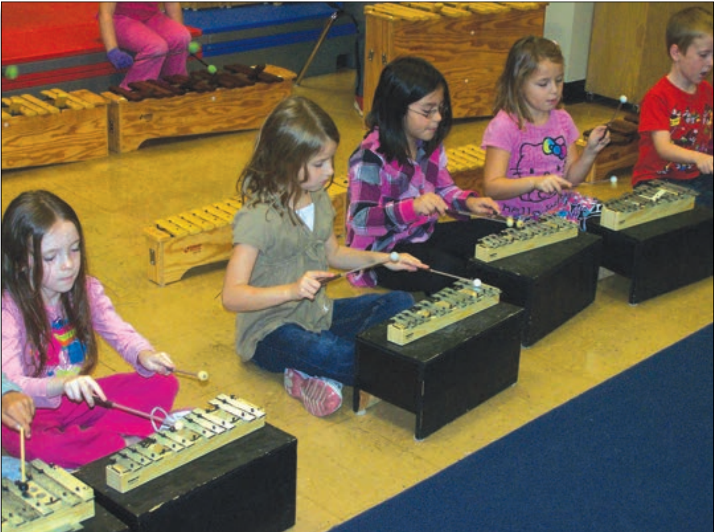
Students at Arthur Elementary School participate in Orff music direction via glockenspiels. Funding for the purchase of the Orff equipment was provided by The Giacioletto Foundation through the Foundation's School Project Grants program.

Jefferson High School – Spark-ing Student Interest in 21 st Century Learning