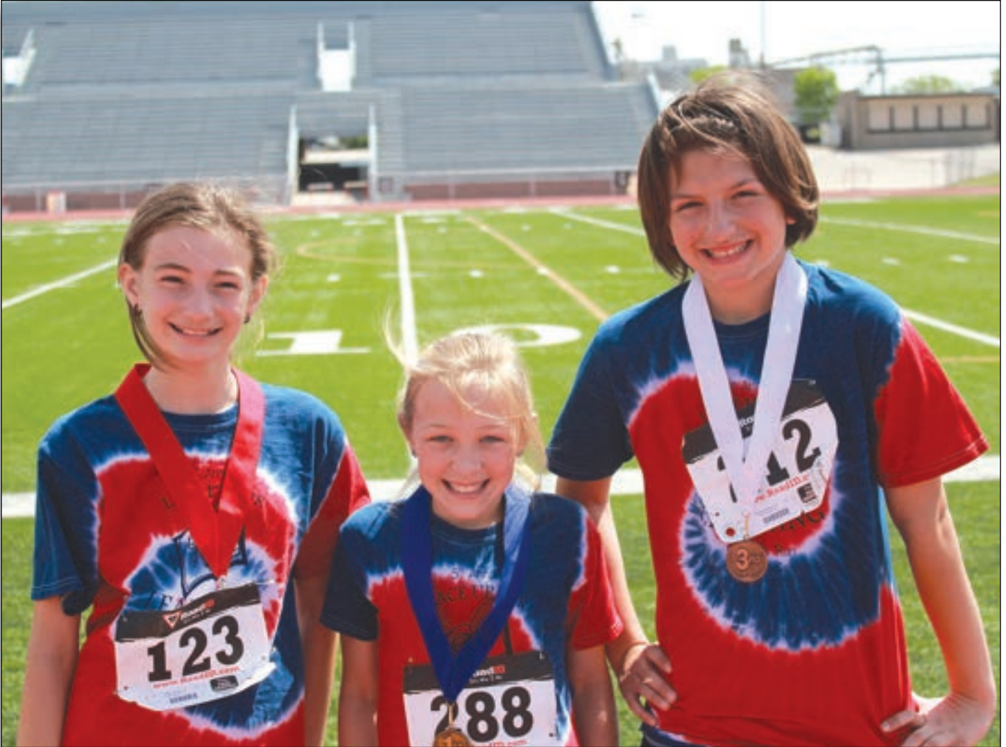
2012 "Lace Up for Learning" event raised nearly $10,000 for Foundation programs