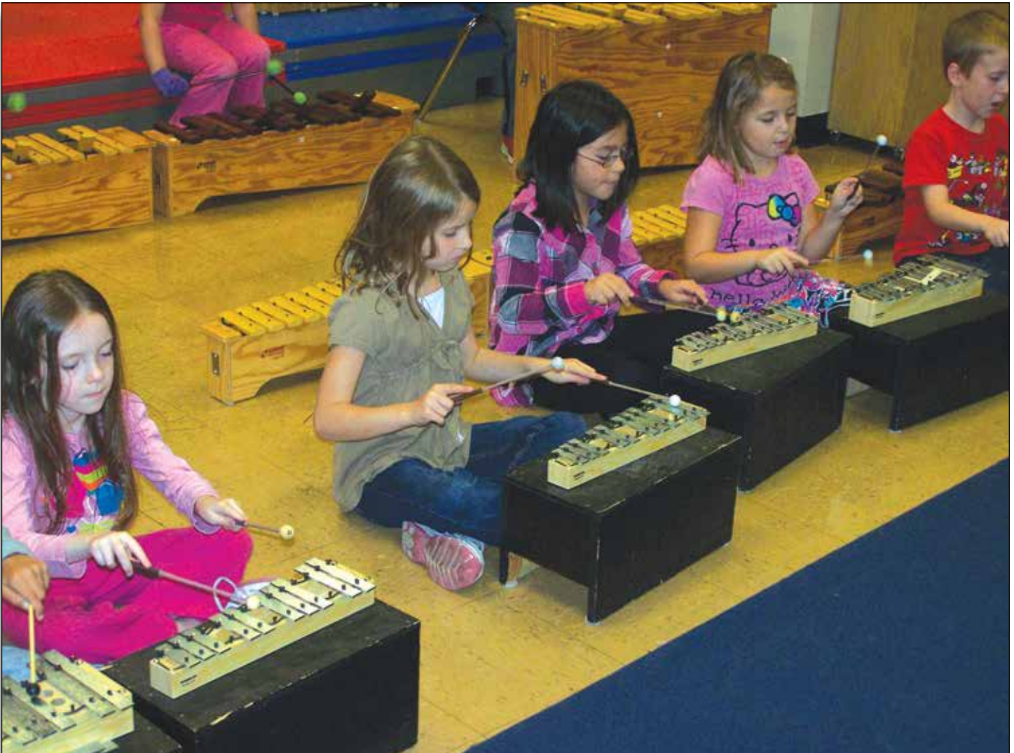
Students at Arthur Elementary School participate in Orff music direction with glockenspiels. Funding for the purchase of the Orff equipment was provided by The Giacioletto Foundation through the Foundation's School Project Grants program.