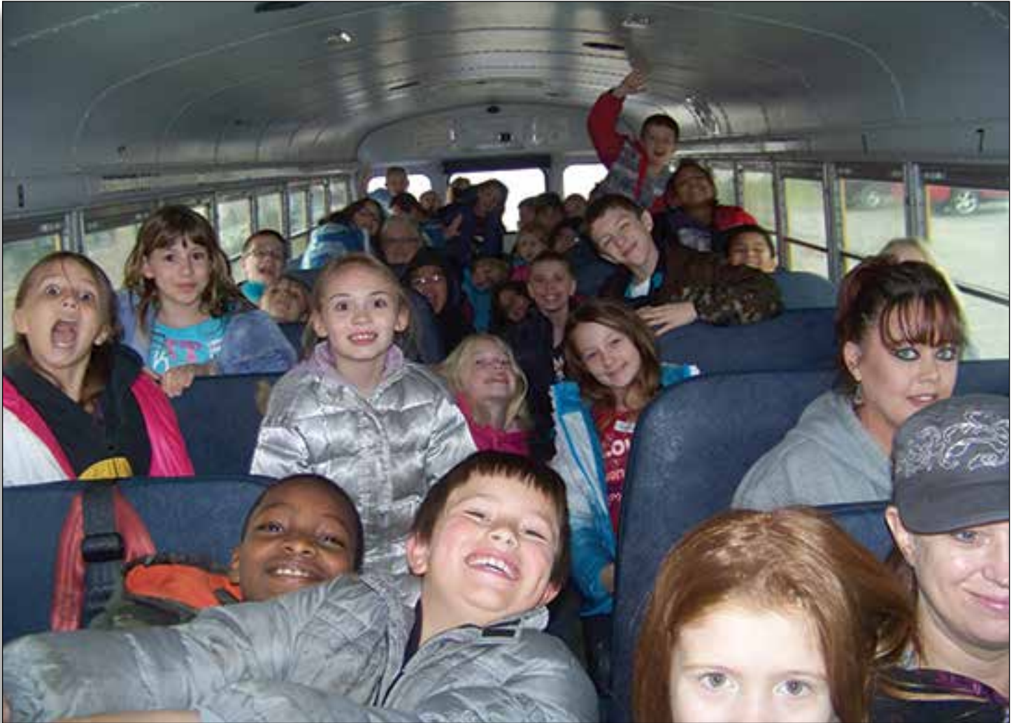
Students from Cleveland Elementary on their way to a curriculum-based field trip funded through the “Kids in the Community” field trip program